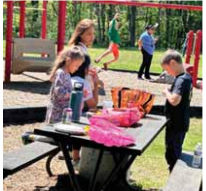
4 photos by L. Denny

More photos from the Easter Egg Hunt can be found on page 11.