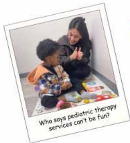
Who says pediatric therapy services can't be fun?

The Parkwood Association Board of Directors will be assessing whether or not opt-in deliveries will continue.